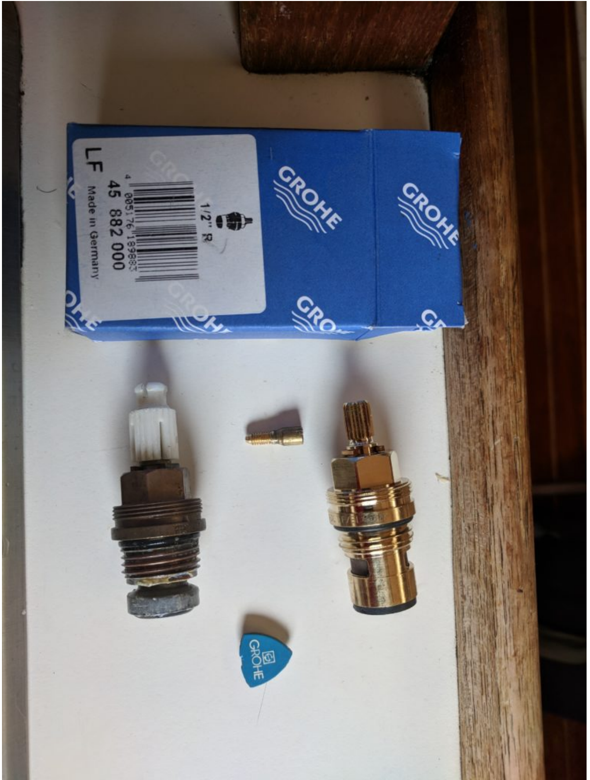
Old vs New comparison