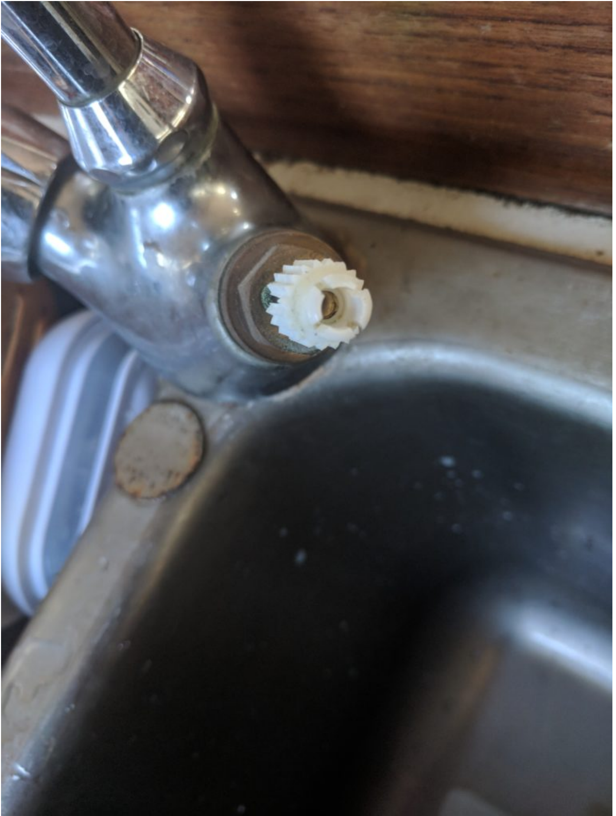
Old cartridge removal