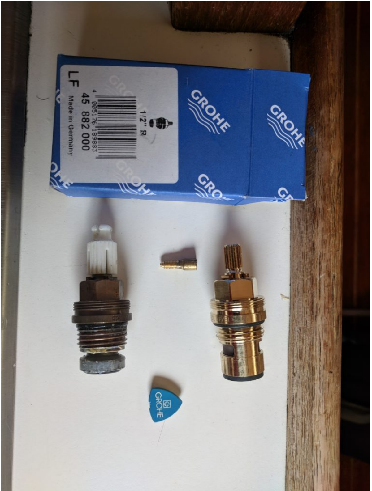
Old vs New comparison