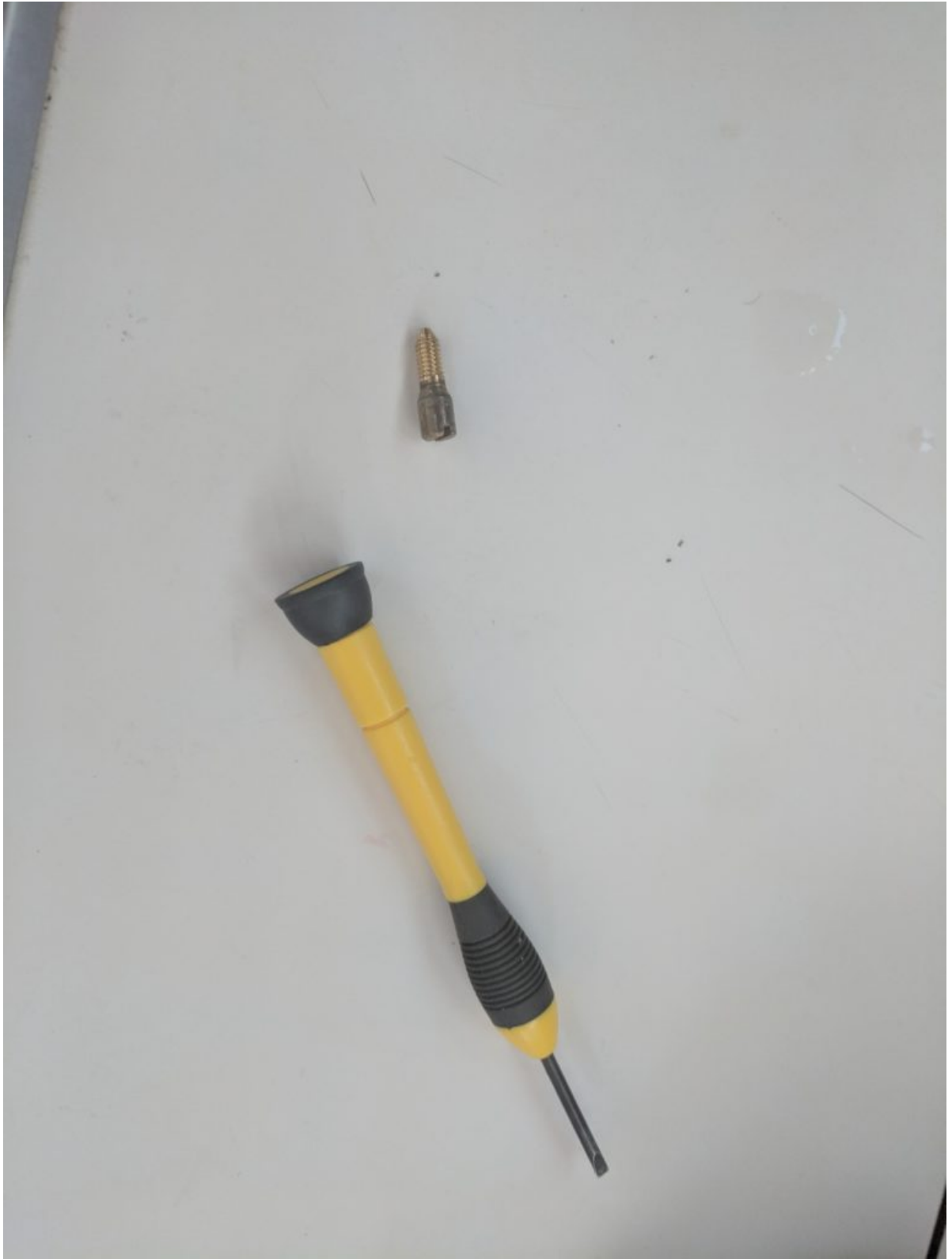
Small crew inside cartridge