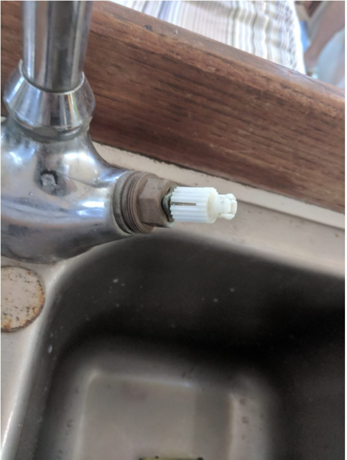
Old cartridge removal